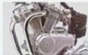
805cc V-twin engine