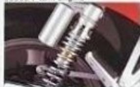
Rear shock absorber with piggy reservoir