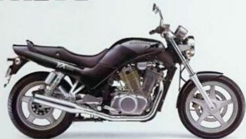
BODY COLOR: BLACK